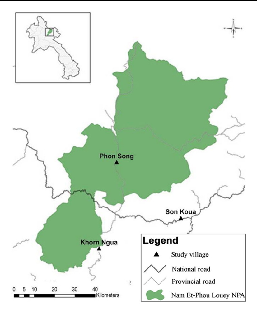
Fig. 1 Location of the three study sites in Laos. The map also shows the Nam-Et Phou Louey National Protected Area and roads

cultivation cycle. The agricultural season can be divided into four sub-periods: slash and burn, planting, weeding, and harvesting. No commercially produced fertilizers and pesticides are applied. Wild animals and plants are considered important sources of calories, protein, and essential vitamins. The main trapping and catching techniques for rodents are snares, single-capture traps, and pitfall traps.